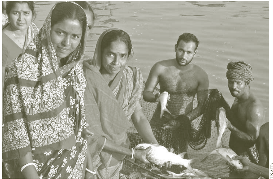
USAID/Bangladesh helped to make small scale aquaculture a viable means of income for women and very poor farmers.

Economic growth is, to a considerable extent, a matter of increasing productivity—and increasing productivity often requires new technologies. In recent years, USAID has lost much of its technical expertise and is now largely staffed by generalist program and project managers. Technical expertise—to the extent that it was sought—has been increasingly outsourced.